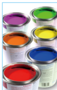
Paint & Ink